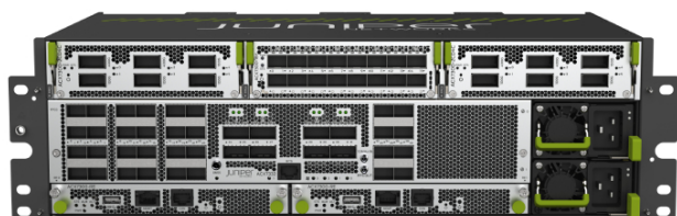
Figure 2. Juniper Networks ACX7332—engineered for the IP service fabric of a Juniper Cloud Metro