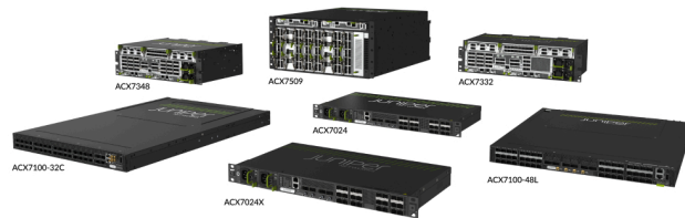
Figure 1. Juniper Networks ACX7000 Family—engineered for the IP service fabric of a Juniper Cloud Metro

ACX7000 family of routers, purposely built for the IP service fabric underlay of a Juniper Cloud Metro , leverages the industry's fastest chipset, provides a unique balance of system design, and sets new benchmarks for sustainable high-performance platforms. Managed by Junos® OS Evolved and Juniper Paragon™ Automation , ACX7000 routers are embedded with Paragon Active Assurance and with Zero-Trust security built in, enabling operators to deliver highly differentiated customer experiences. Available in environmentally rated, fixed, fixed plus modular, and fully modular designs, these energy and footprint efficient, multiservice routers support high-precision timing technologies and are engineered for service provider, enterprise, residential (including passive optical network (PON) with the Juniper Unified PON Solution ), IoT, and 4G/5G mobile applications.